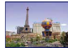
PARIS from $115