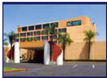
QUALITY INN & SUITE MONTEBELLO from $95