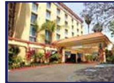
EMBASSY SUITES ARCADIA - PASADENA from $162