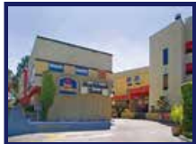
BEST WESTERN MARKLAND MONTEREY PARK from $90