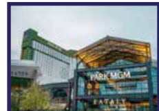
PARK MGM from $99