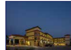
HARTFORD HOTEL ROSEMEAD from $129