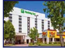
HOLIDAY INN LA MIRADA from $106