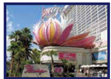
FLAMINGO from $78