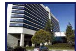
CROWNE PLAZA SILICON VALLEY from $125