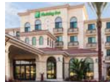
HOLIDAY INN EL MONTE from $133