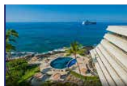
ROYAL KONA RESORT KONA - HAWAII from $188