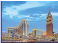
THE VENETIAN from $195