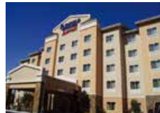
FAIRFIELD INN BY MARRIOTT WEST COVINA from $133