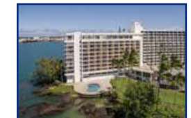
GRAND NANIHOA DOUBLE TREE - HILO from $146