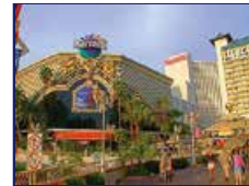
HARRAH'S from $88