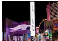
THE LINQ from $88