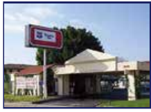
BOKAI GARDEN HOTEL ROSEMEAD from $83