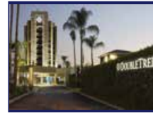
DOUBLETREE MONROVIA from $180