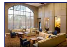
COURTYARD BY MARRIOTT NEWARK SILICON VALLEY from $130