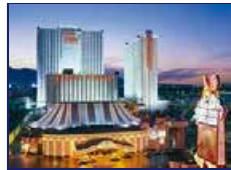
CIRCUS CIRCUS from $70