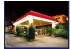
BEST WESTERN PLUS EXECUTIVE INN ROWLAND HEIGHTS from $115