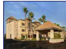
AYRES SUITES DIAMOND BAR from $119