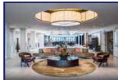
HILTON IRVINE ORANGE COUNTY AIRPORT from $118