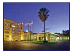
CROWNE PLAZA UNION CITY from $130