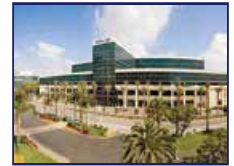
HILTON ANAHEIM from $165