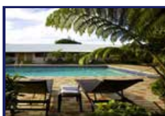
HILO SEASIDE HOTEL HILO - HAWAII from $123