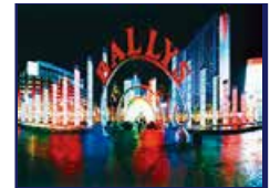
BALLY'S from $78