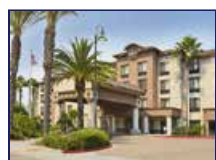
COUNTRY INN & SUITES BY RADISSON ONTARIO from $136