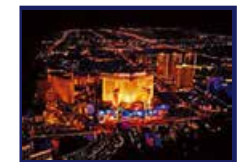
PLANET HOLLYWOOD from $100