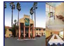
QUALITY INN WALNUT from $97