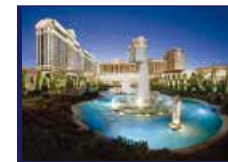
CAESARS PALACE from $118