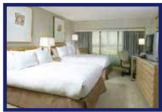
HILTON LAX AIRPORT from $169