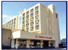
LINCOLN PLAZA HOTEL MONTEREY PARK from $120