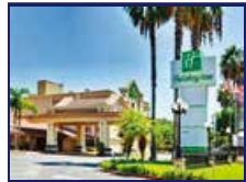
HOLIDAY INN BUENA PARK from $108