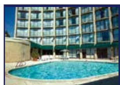
RED LION SALT LAKE CITY from $113