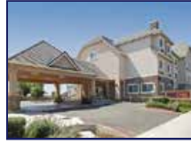
QUALITY INN ROSEMEAD from $115