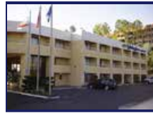
FAIRFIELD INN BY MARRIOTT ROSEMEAD from $165