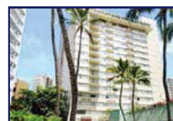
RAMADA PLAZA WAIKIKI - HAWAII from $170