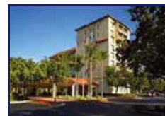
SHERATON SAN JOSE from $130