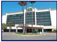
LA QUINTA SUITE BUENA PARK from $108