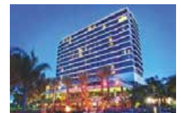
PACIFIC PALMS RESORT CITY OF INDUSTRY from $165