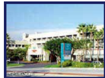
DOUBLE TREE HOTEL ROSEMEAD from $150