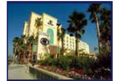
HILTON SAN GABRIEL from $186