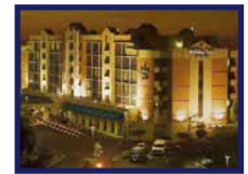
HOLIDAY INN SELECT DIAMOND BAR from $150